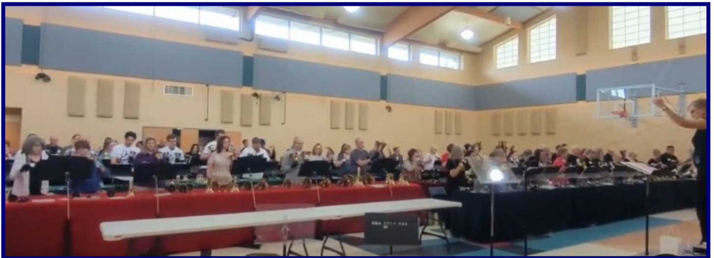
The Jubellation Bell Choir attended the North Hills Handbell Festival on Saturday, April 27 in Allison Park, PA.