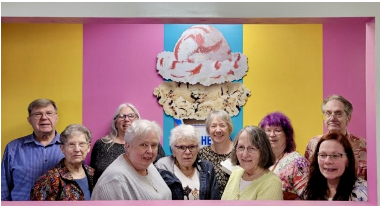
J.O.Y. Group Trip to Ravenna. Lunch, antique mall and ice cream!